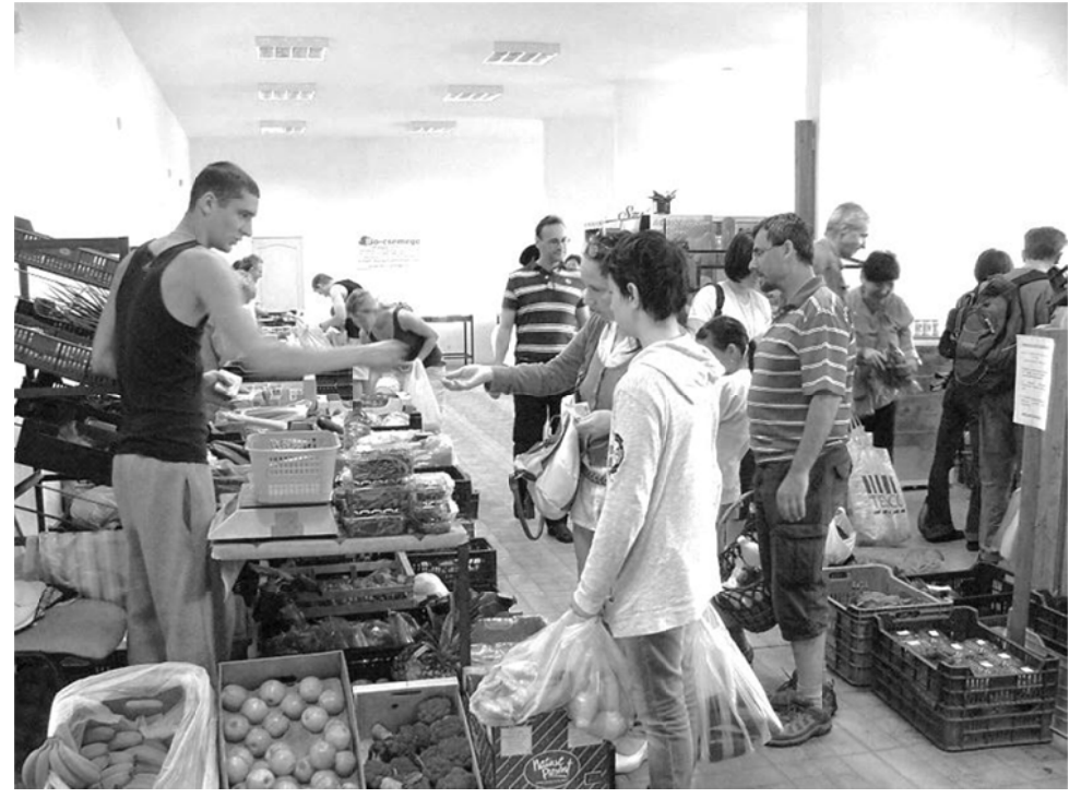
Weekly organic market in Újpest, Budapest.