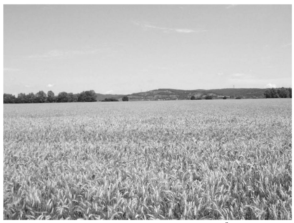
Picture: An organic wheat field in western Hungary.

Although more than half the organic area is grassland, organic animal husbandry is relatively insignificant compared to crop production. In 2010, less than 100 farms kept certified organic livestock, which is less than one tenth of the organic producers. The reason is that most of the animals grazing on organic fields are not certified because farmers consider the certification costs to be too high, and the existing regulations do not stipulate that only certified animals can be kept on organic grassland. As a result, organic grasslands receive substantial subsidies without creating any significant organic production: a situation that shows the inadequate structure of the current support scheme.